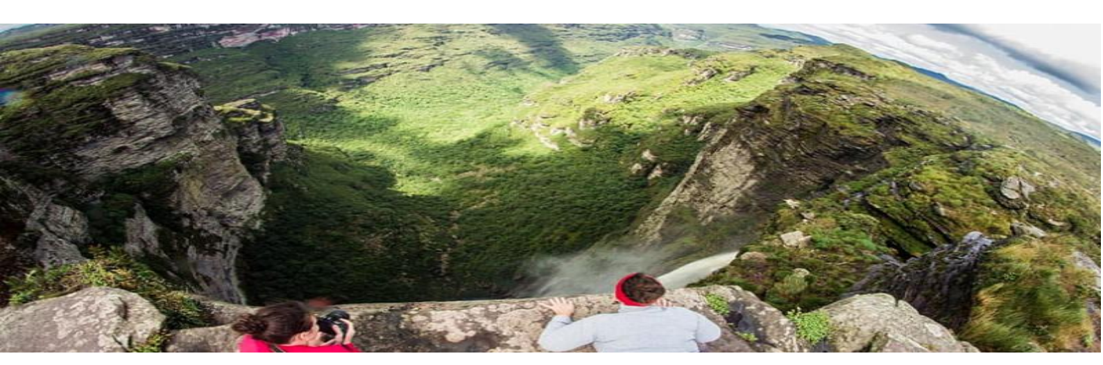
Cachoeira da Fumaça (Fumaça Waterfall)

The Pati Valley trek is a complete hiking experience. In addition to the amazing views, canyons, landscapes, waterfalls, and natural beauties, visitors also come into direct contact with the local history and culture and learn about the way of life of these mountain people. To enrich the tour even more, you will visit the Fumaça Waterfall - one of the highest waterfalls in all of Brazil.